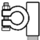
Type 2 (Left)