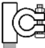
Type 2 (Right)

Order must state terminal type and polarity (+ or -)